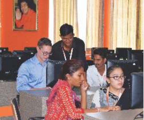
Learning under IAESTE