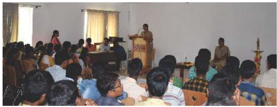
College She Team

Day 5: Debate event on Nature v/s Technology.