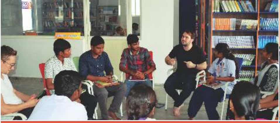
Classes with foreign faculty under RIT program

dictionary, functions, modules, file i/o, exceptions, date and time and advanced topics such as multithreading, XML parsing, GUI programming and further extensions along with application development techniques, debugging techniques. The workshop concluded with a written exam and awarding of participation certificates