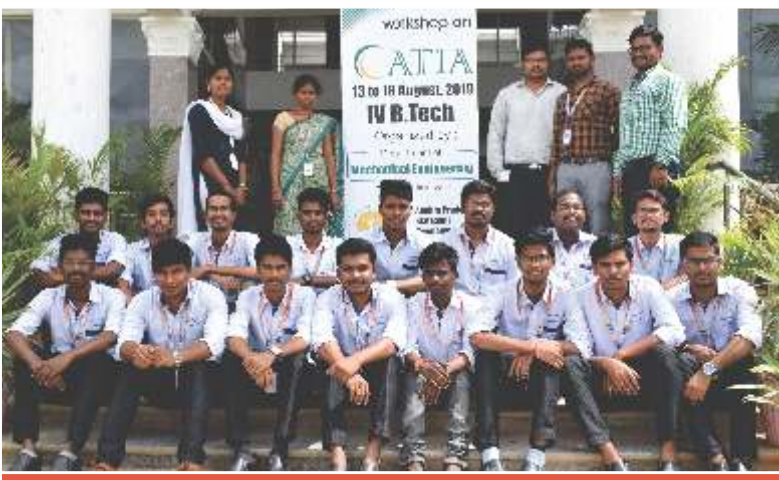
Workshop on CATIA