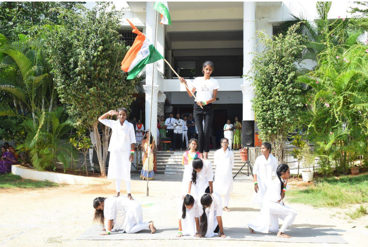
Pyramids by Girls