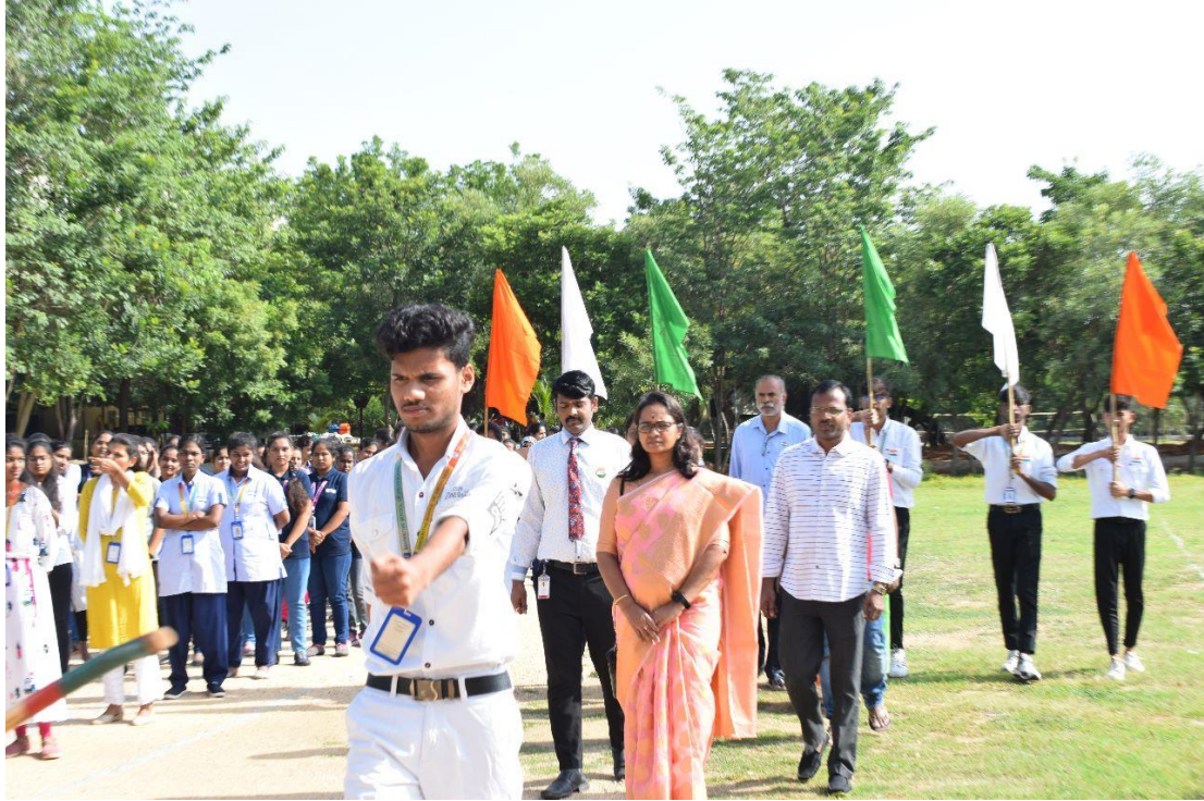
Head Boy Escorting Academic Dean, Directors, HODs