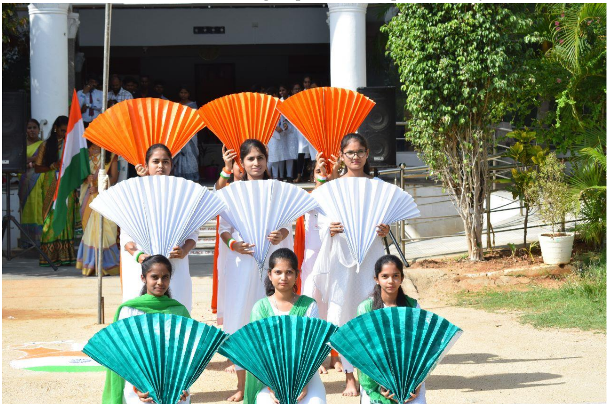
Formation Dance by 2 nd ECE Girls