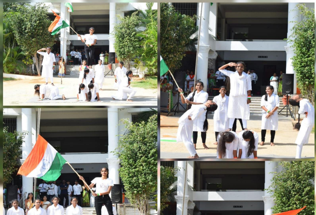
Pyramids by Girls