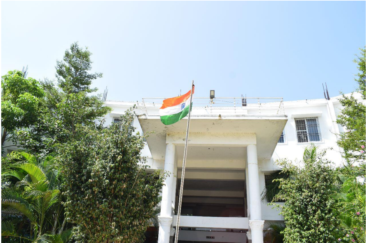
Our National Flag